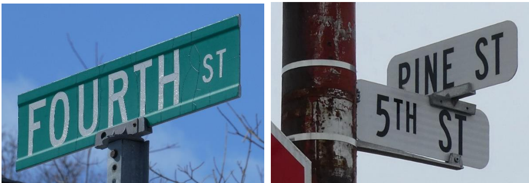
Undesirable new signs for Historic District

New signs are expected to conform to the Federal Highway Administration's (FHA) Manual on Uniform Traffic Control Devices (MUTCD). Each state must adopt this standard or a version of it. Fortunately, Michigan has a revised version, which provides exceptions for Historic Districts. The 2011 Michigan Manual on Uniform Traffic Control Devices (MMUTCD) was revised in 2013 and is based on the 2009 Federal edition. On page 163 (MI), section 2D.43 Street Sign Names, paragraph 24 lists these exceptions. Among the exceptions are size, font and reflectivity. The most common new street signs are 6" tall with white reflective lettering on a green background. The lettering is 4" in a Clearview font with only a leading capitol letter and the remaining lower case. Another common new sign in our area is a 6" rounded rectangle with black letters on a white reflective background with aluminum brackets which are held in place with stainless steel band clamps. We do not want either of these sign styles in historic downtown Calumet. We want new signs that are easily readable, distinctive, and historically appropriate and their unique style will indicate you are in a special area.